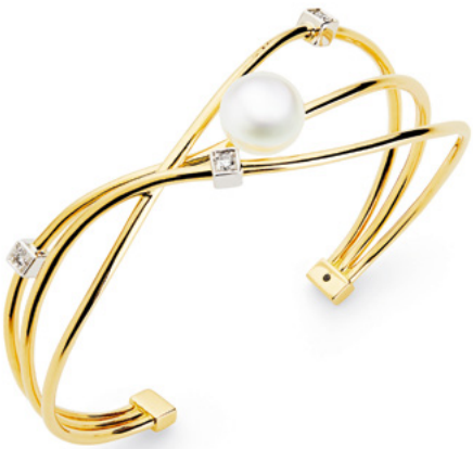
LUNA Pendant from $2,290 (chain sold separately) Studs from $4,100 ORBIT Cuff $8,800 OPEN ORBIT Ring $3,400