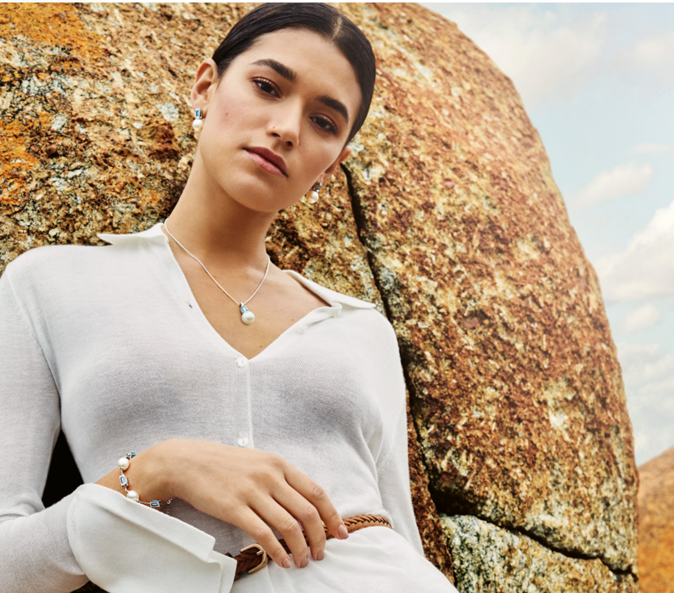
(Left and above) SUGARLOAF BY DAY Stud Earrings $8,995 Pendant $4,275 (chain sold separately) Ring $7,650 Bracelet $8,950