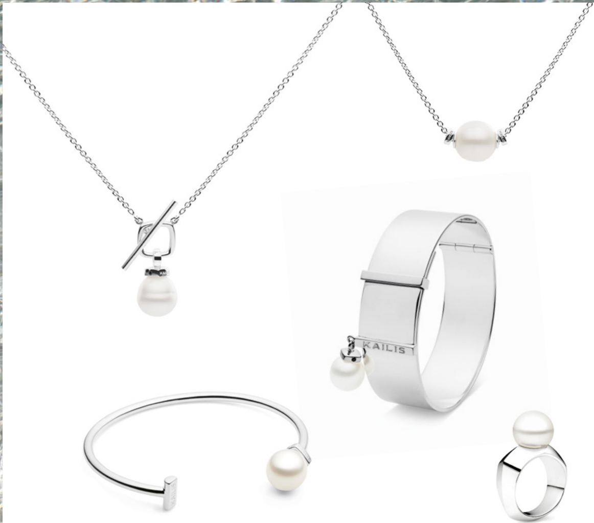
T-bar Necklace from $690 Sliding Pearl Necklace from $650 ELEMENT Cuff $675 Clip Bangle $1,250 NYX Ring from $950