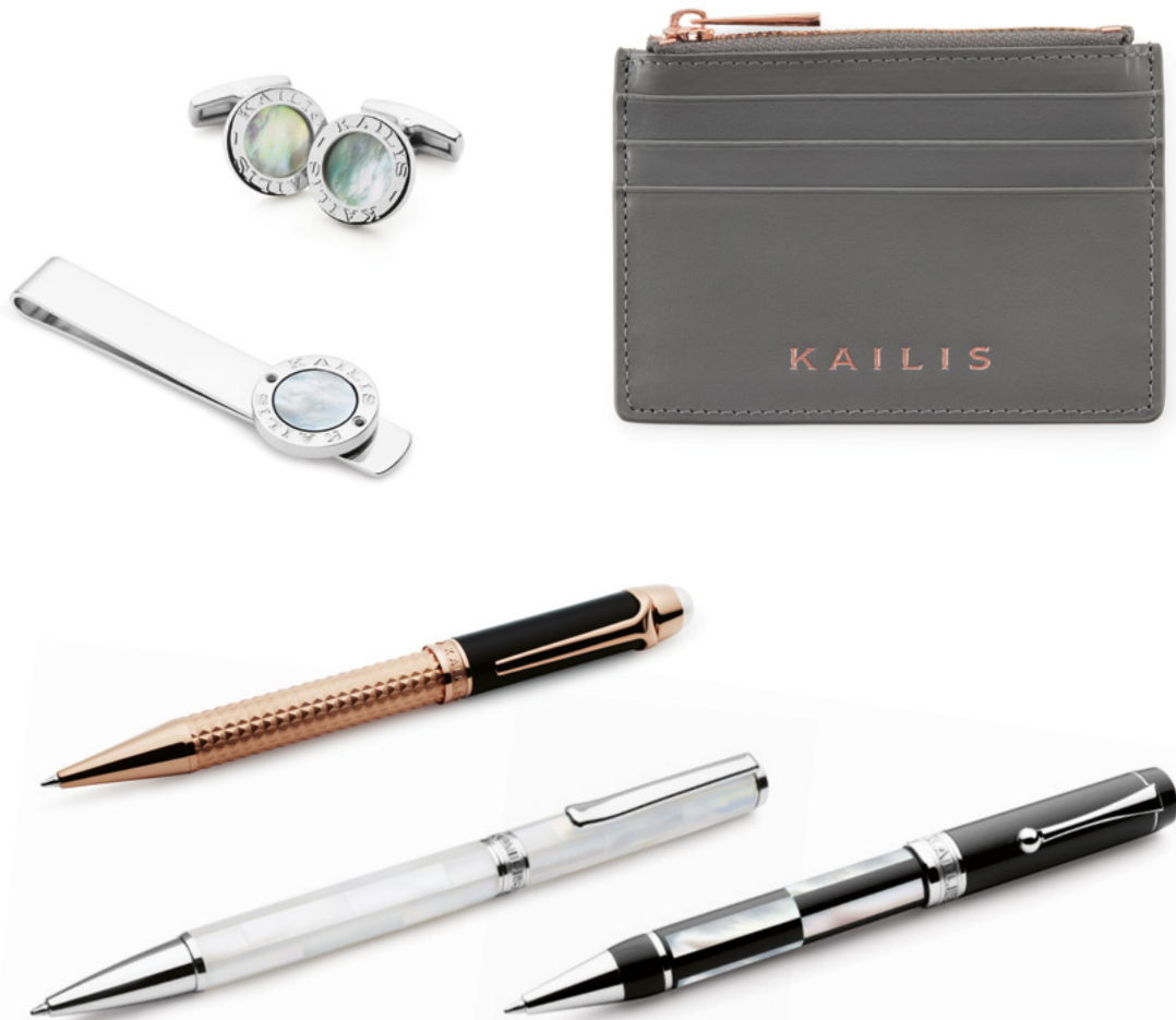
Mother of Pearl Cufflinks $205 Mother of Pearl Tie Bar $210 Leather Card Holder, Rose $120 Metallico Pen, Rose Gold $160 Mother of Pearl Pen $130 Mother of Pearl Pen, Black Enamel $95