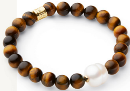
(Left) VIGOUR Bracelet, Lava $495 ACCORD Bracelet, Golden $195 (Above) VIGOUR Bracelet, Turquoise $495 BALANCE Bracelet, Silver $640 VIGOUR Bracelet, Tigers Eye $495