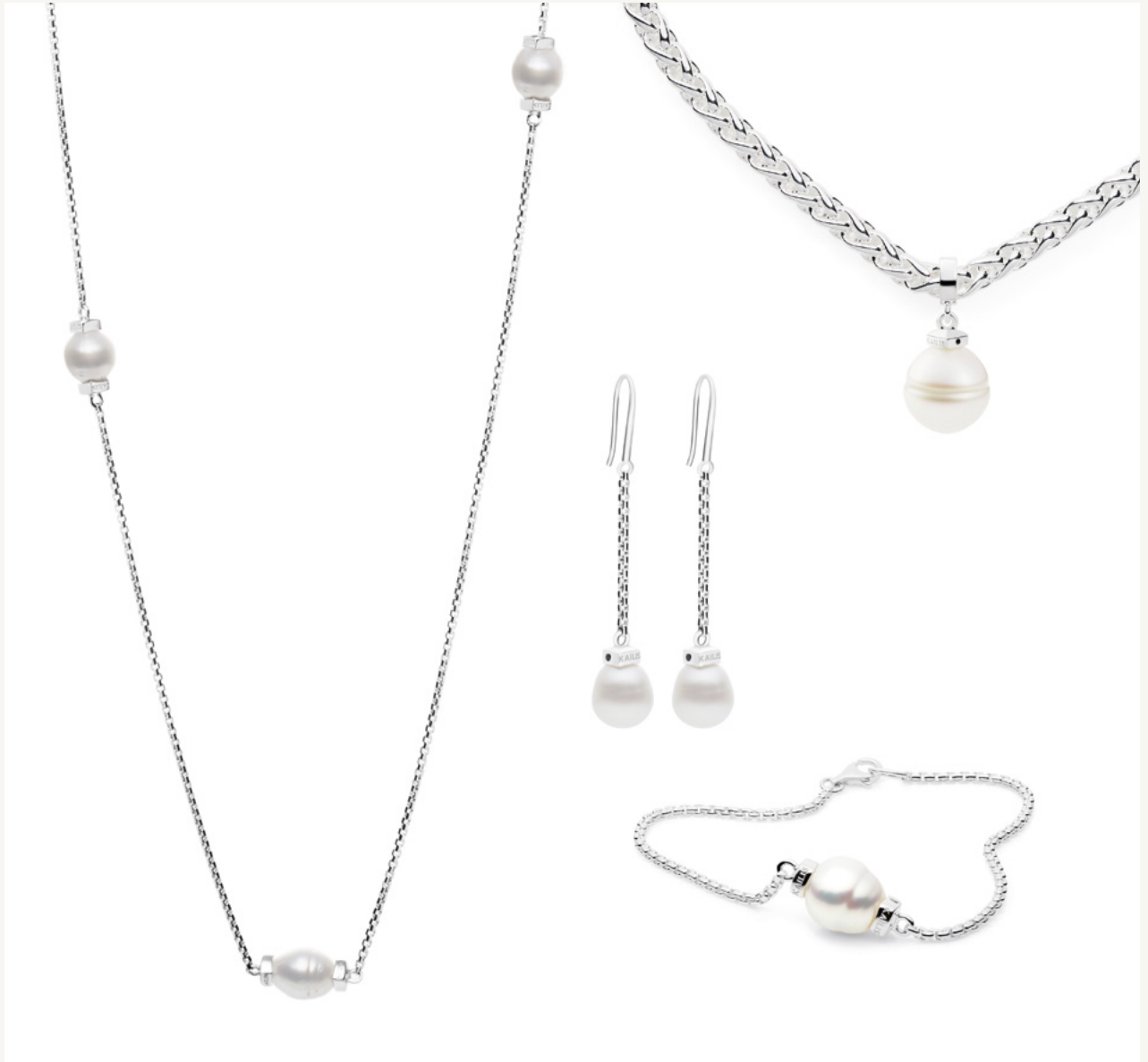
(Previous page) ANTHEIA Earrings from $1,500 (Above) CONTEMPO Necklace from $1,995 GEOMETRIC Wheat Sliding Necklace from $1,500 CONTEMPO Earrings from $890 Bracelet from $495