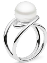
TRANQUILITY Lariat Necklace $5,750 OPEN LINK Bracelet from $5,250 DIAMOND HUGGIE Earrings $2,200 ADORED Ring $15,950 ELEMENT Cuff from $4,950 WAVE Ring from $2,950