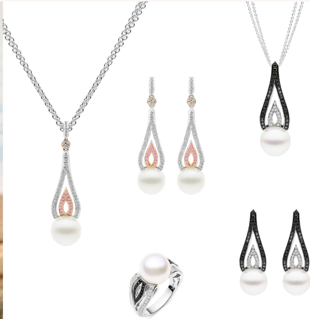
(Above) FLAME ROSE Pendant $10,650 (chain sold separately) Earrings $18,990 (Left and above) FLAME NOIR Pendant $4,600 (chain sold separately) Earrings $9,400 Ring $6,995